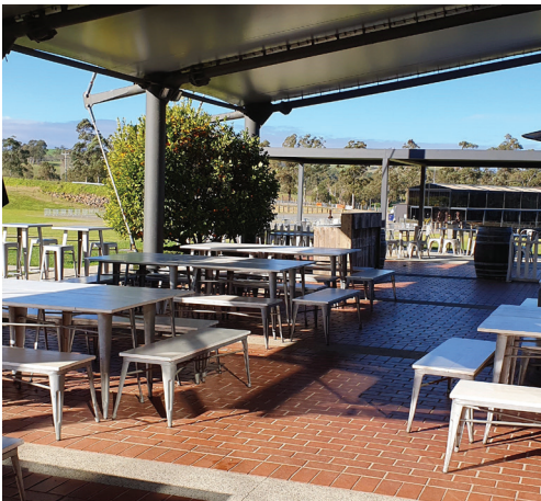
THE TERRACE up to 80 guests