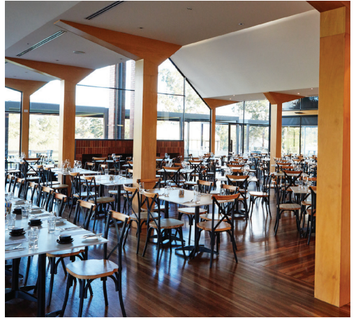
RESTAURANT shared space / 200 guests