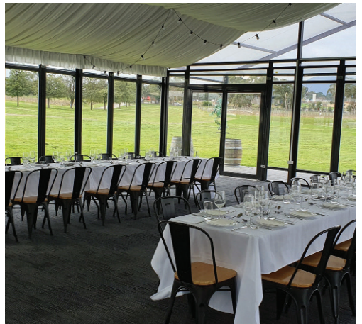
THE CONSERVATORY minimum of 50 guests *Sharing and Beverage Packages Only