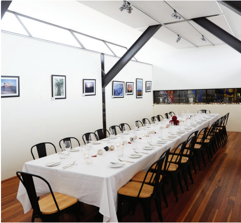
PINOT GALLERY mimimum of 20 guests